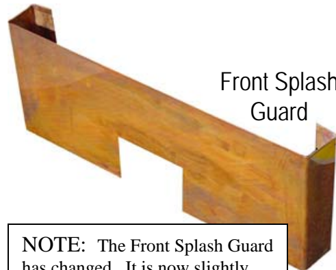
Front Splash Guard

NOTE: The Front Splash Guard has changed. It is now slightly narrower and has no notch. See Section 7 for instructions.