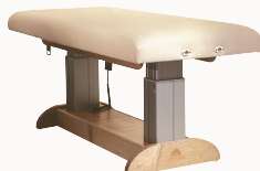
RECTANGULAR OR ROUNDED CORNERS