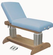
BACK REST TOP