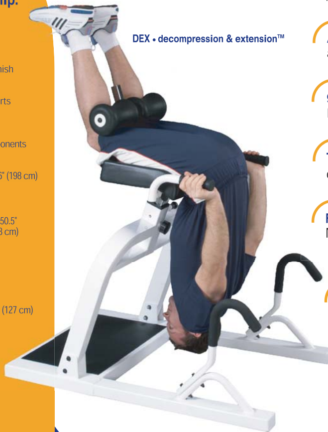
DEX • decompression & extension™

Self-operated forward rotation using the lower handles for support