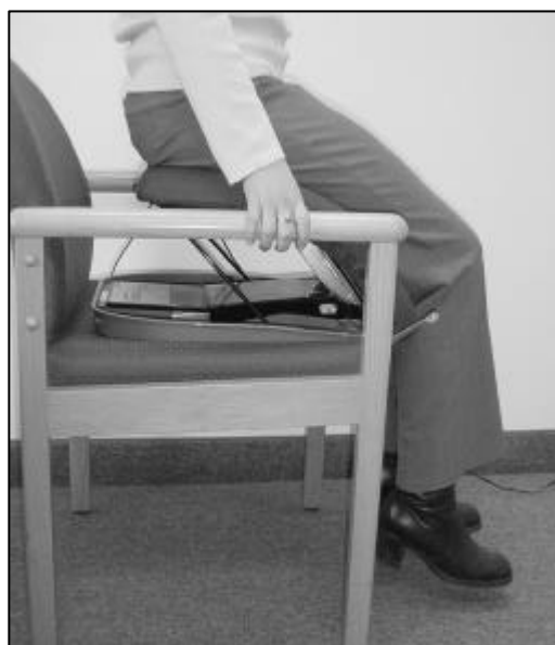
Incorrect Usage – Cushion too High If your Uplift Power Seat is raised too high, you will have difficulty sitting down without hopping onto the cushion. In order to maintain stability and reduce your risk of falling, lower the cushion to a height that allows you to keep both feet on the floor.