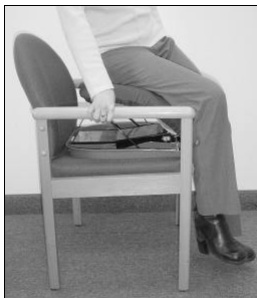
Incorrect Usage – Sitting Lopsided If your Uplift Power Seat is correctly positioned, you should be able to sit down squarely on the cushion and keep both feet on the floor. If you find yourself sliding sideways onto the cushion, the cushion is lifted too high for you, and you could fall or damage the product. Instead, lower the cushion to the correct height before using.