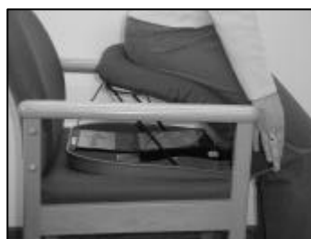
Lowering the lifting cushion To lower into a seated position, gently push downward on the power lever.

Note: Please remember that it is neither necessary, nor advisable to keep pushing/pulling on the lever once the motor has started.