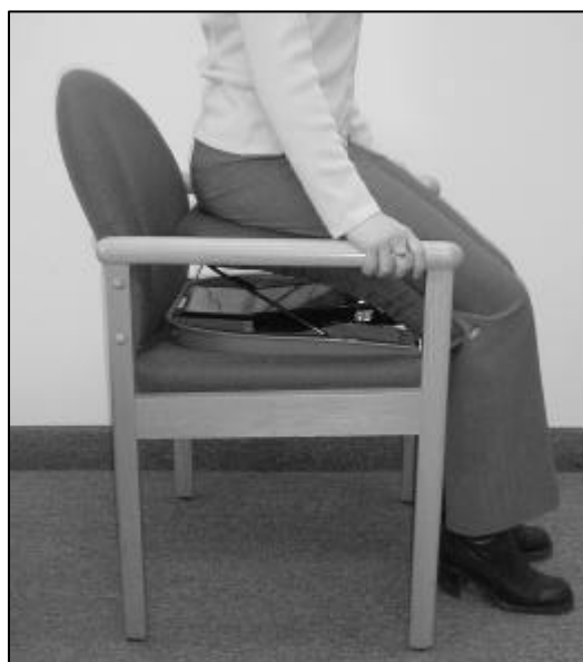
Correct Usage: Both Feet on the Floor Before sitting, ensure the Uplift Power Seat is at the ideal height for you to sit while keeping both feet flat on the floor. Keep at least one hand on an armrest for support while lowering the cushion.