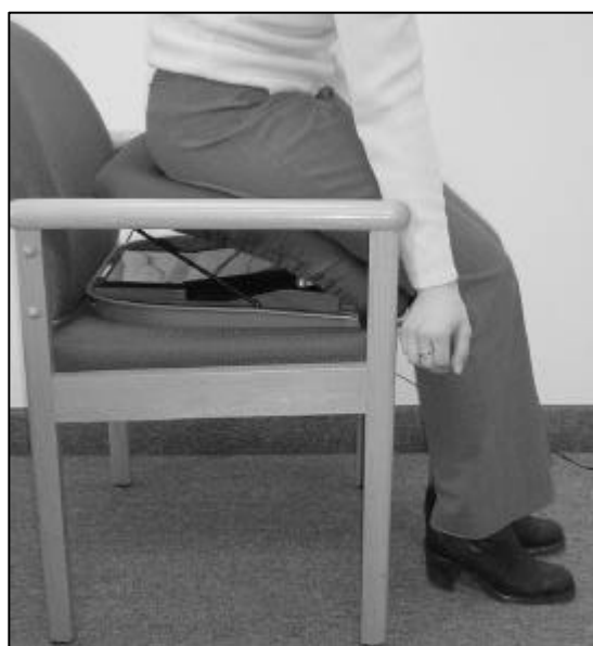
Incorrect Usage – Too Much Force on Power Levers Power levers require minimum force in order to operate the up and down motion. Placing excessive force on the levers is unnecessary and could result in the levers breaking.