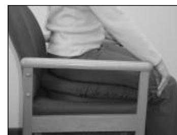
Raising the lifting cushion To rise from a seated position, gently pull upward on the power lever.