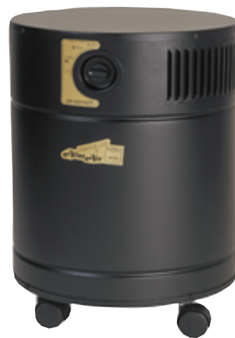
The 6000 VOCARB

24 lbs. of specially impregnated activated carbon, combined with true HEPA